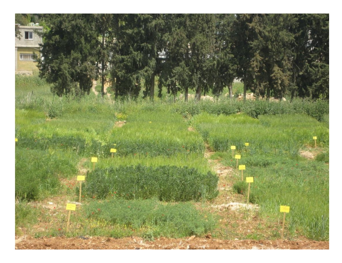
Figure 2.3. Photo representing the examined five legumes crops planted at Al-Arroub site.