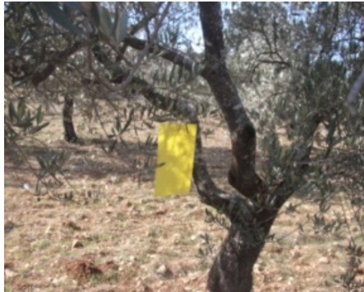
Figure 1: Yellow colored sticky trap

To monitor the flight activity of olive fruit fly, an experiment was carried out in the olive grove from 1st July 2012 - 30th October 2013. Four traps were used, each constituted yellow colored sticky rectangular poster-boards 15*25 cm dimension (Fig. 1). One side of the board was painted with adhesive (sticky) paste, which is Rinifoot® (Polisobutene 80%). Traps were hanged on randomly selected trees (one in each block in the olive grove) at a height of 1 to 2 m. The sticky board were weekly monitored, exchanged, and took back to the laboratory where, the captured olive fruit flies were counted and sexed under binocular microscope.