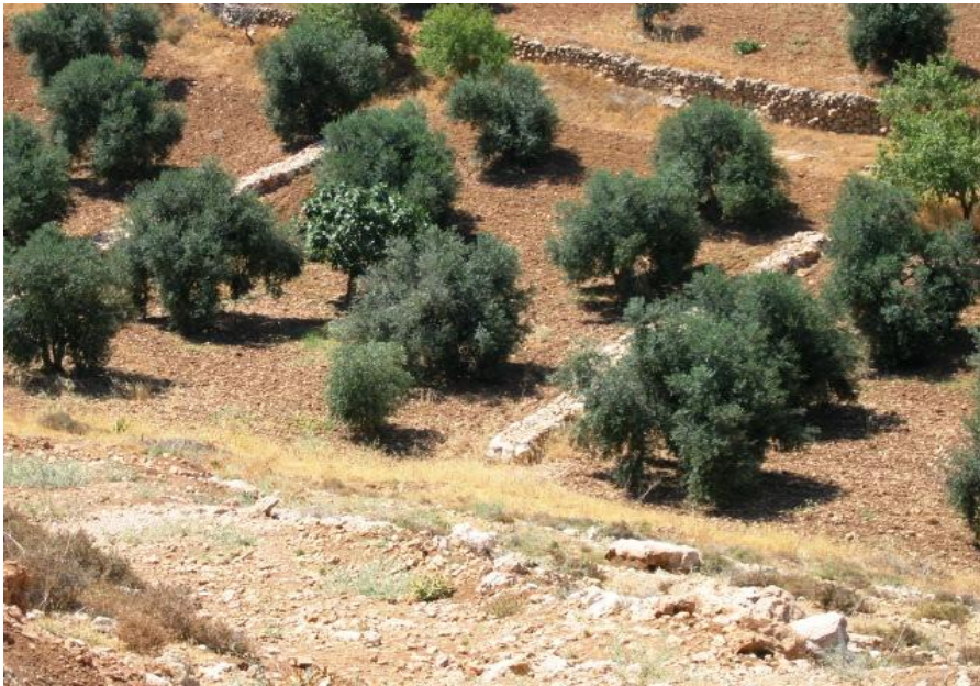
Figure 1: SWTT implemented in study sites in 2003/2004